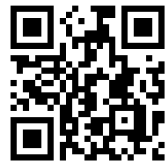
El Dorado County CodeRED Sign-Up