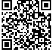
Amador County CodeRED Sign-Up